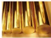
圆铜棒 Round bar