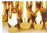
方铜棒 Square bar